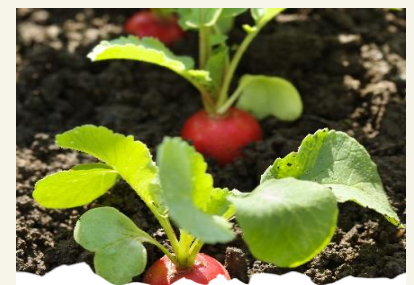
Ready for harvest