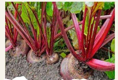
Ready for harvest