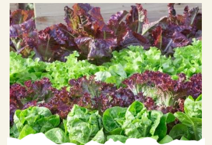
Ready for harvest