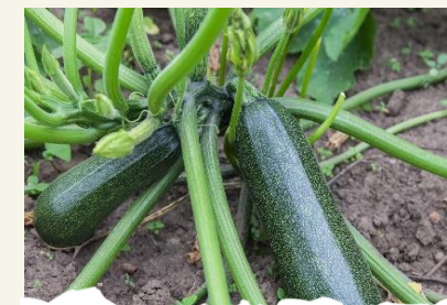
Ready for harvest