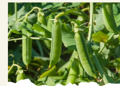
Ready for harvest